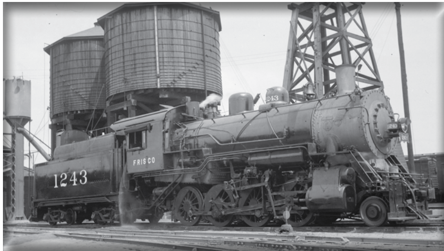
SLSF #1243 2-8-0 at Sherman headed to Dallas and Fort Worth

The following photos are from http://frisco.org , where they are completely attributed to the photographer.