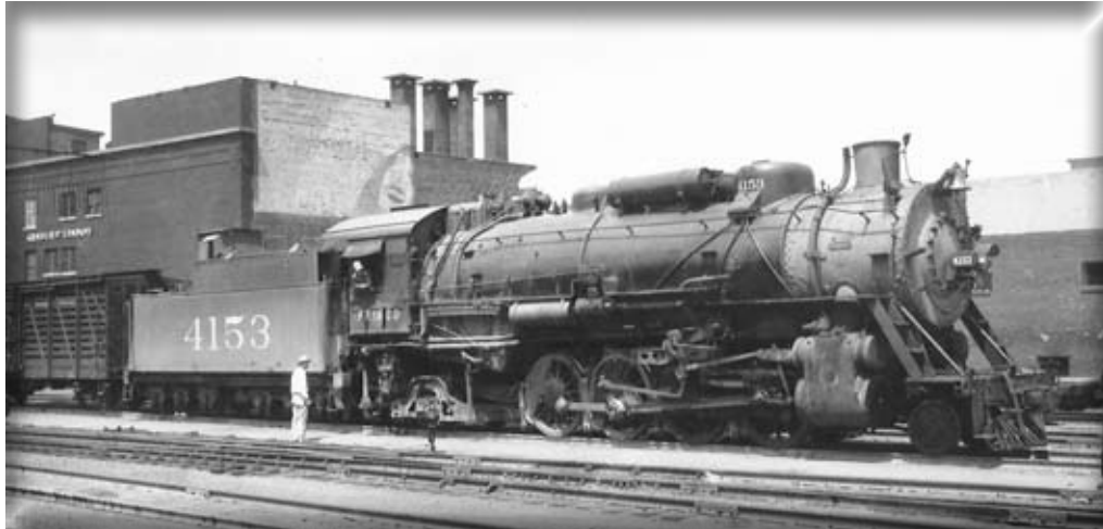
SLSF #4153 2-8-2