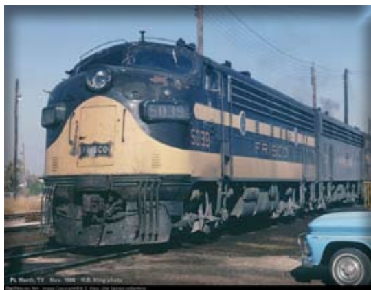
EDM F7A SLSF #5039 @ West yard