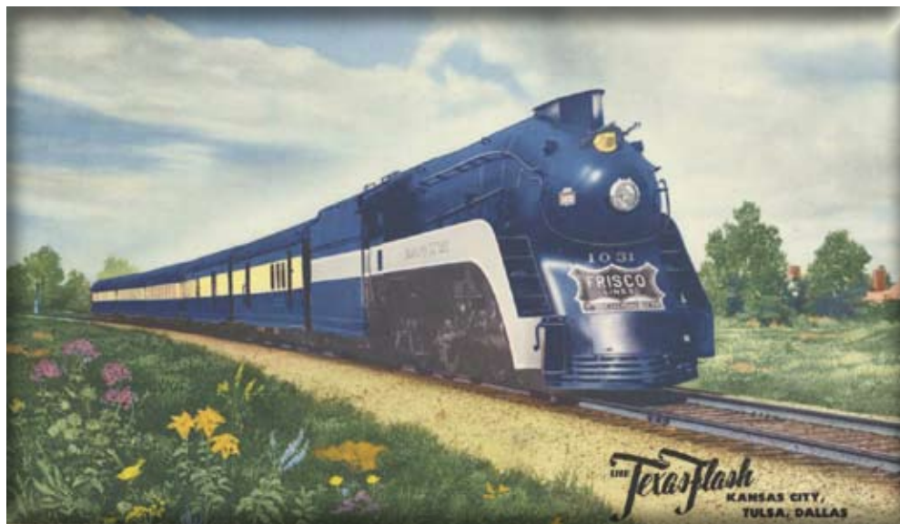
SLSF # 1031 4-6-2 Texas Flash