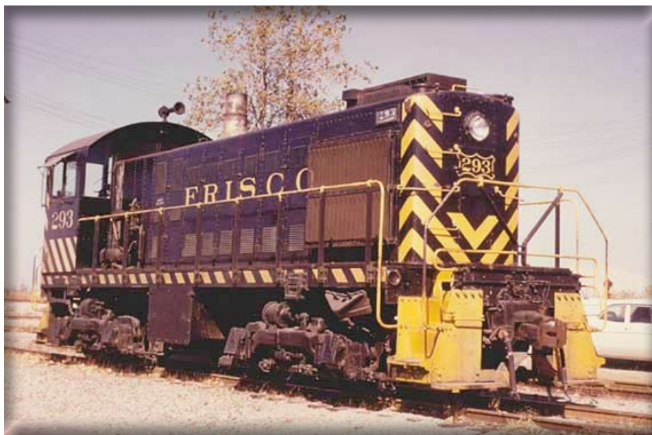
Alco S2 SLSF #293 (290-294)

During the diesel era, the Frisco used Alco S2's for yard switching and EMD F7's and EMD GP7's for regular freight. In later part of the era, GP7's performed yard switching duties. The passenger trains were mostly EMD E-7's and E-8's.