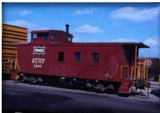
1100 Series shop built plywood caboose #1140 in Fort Worth

During the steam era and early diesel era, the Frisco used shop built steel frame and underframe, wood side, end cupola with straight side steel cupola cars. In the diesel era, these old plywood cabooses slowly ended their service and were followed by the International wide vision, home built from box car wide vision, and old ATSF CD-1 types.