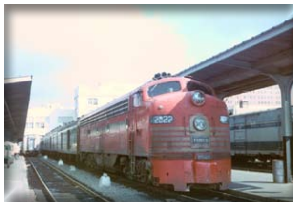
EMD E8 SLSF #2022 Black Gold TR 508