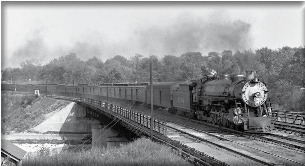
SLSF #1501 4-8-2 at Fort Worth