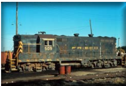
EMD GP7 SLSF #509 indicative of the class