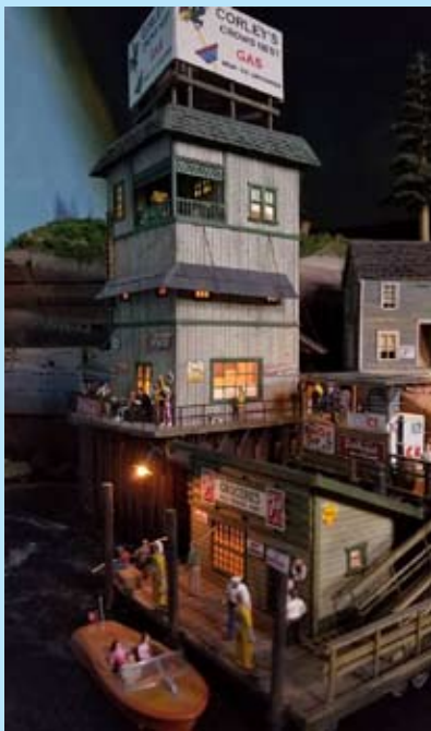
( Above: Corley's Crow's Nest model by Leo Palitti).

Myself on the other hand, needed five more structures to pass as I only had one entry at The Lone Star Region Convention. The six passing structures that I submitted scored point totals of 97-113 points. I've done a lot of scratch building through the years and my two favorite structures are Corley's Crow's Nest and Bailey Brothers Packaging.