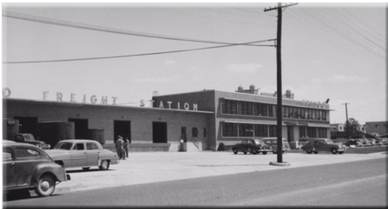
Figure VI-1, Frisco Freight Station 1952

The Frisco Freight House ( Figure VI-1, Frisco Freight Station ) in Fort Worth was located at 700 West Vickery, approximately 2 miles from the West Yard. There were three tracks serving the freight house with a total capacity of 12 cars. This freight house handled all Frisco merchandise, both inbound and outbound, to and from connecting lines, and handled and worked trap cars to and from connections. An aerial view of the station shows the size of the station. The structure on the left side was the primary freight shed ( Figure VI-2 Frisco Freight Station aerial view 2005. )