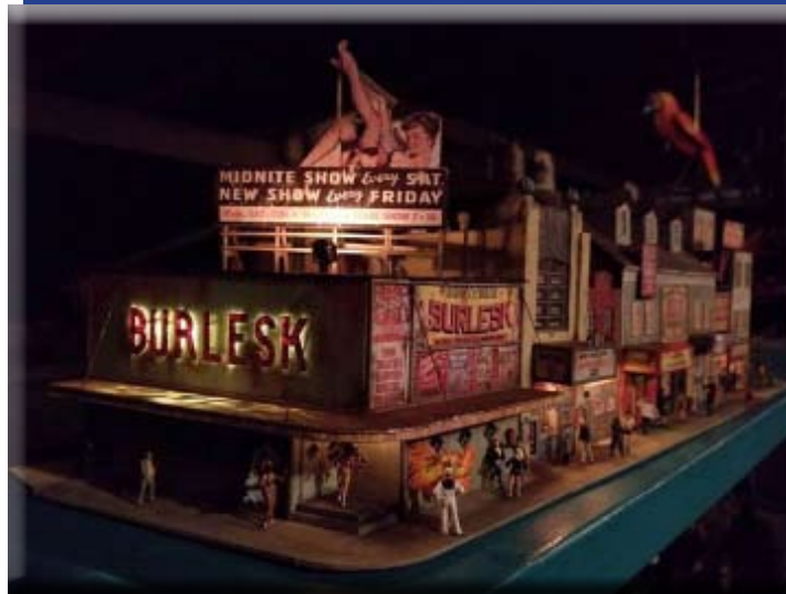
Above Left Photo: Lorrie Palitti's, Red Light District.