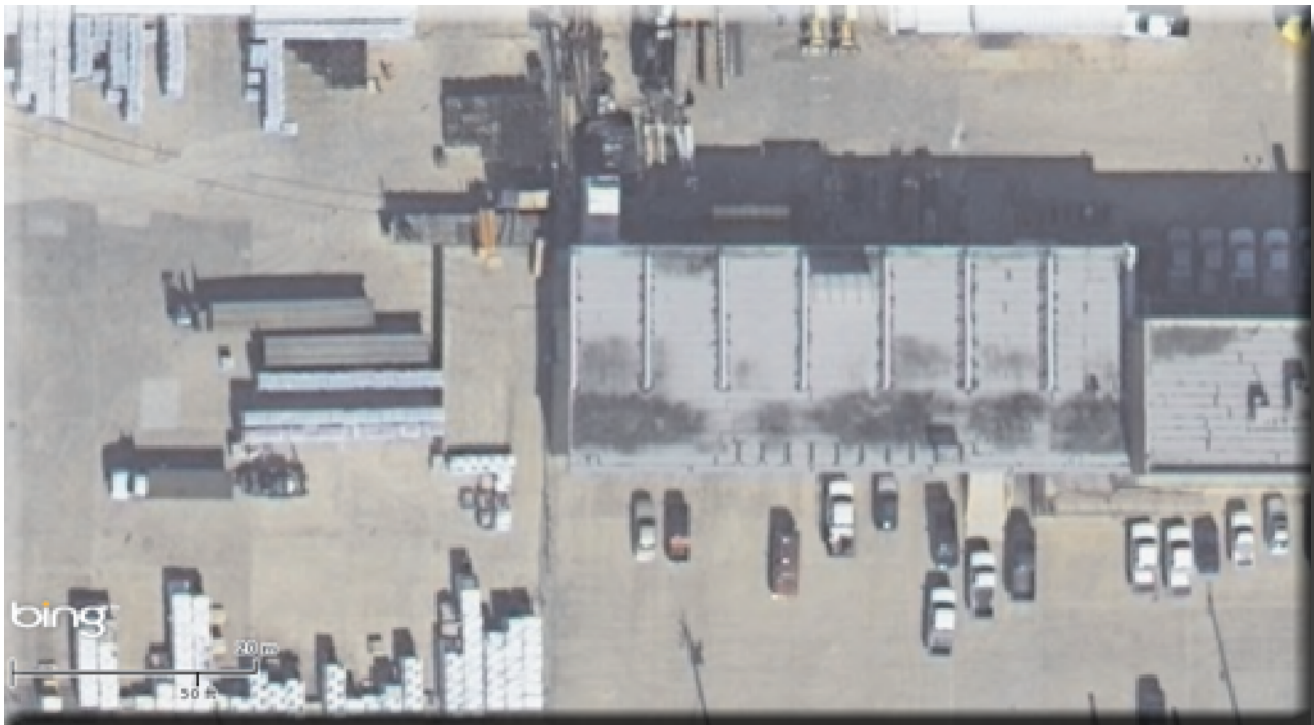
Figure VI-2 Frisco Freight Station aerial view 2005

Merchandise damaged in transit is sent to the freight house. Public auction sales were held and items singly or in lots could be purchased by the highest bidder.