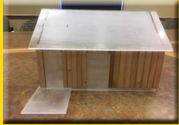
Casey & Cody Akins show their progress on their RGS Structure builds.