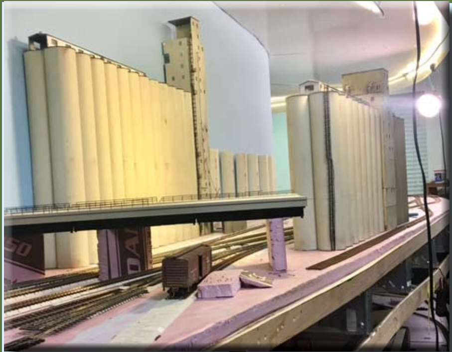
( Ney Yard flavor on the layout )

Another good (very good) resource for learning is to join a Model Railroad Club. I've visited many clubs across the US and Canada over the years and have