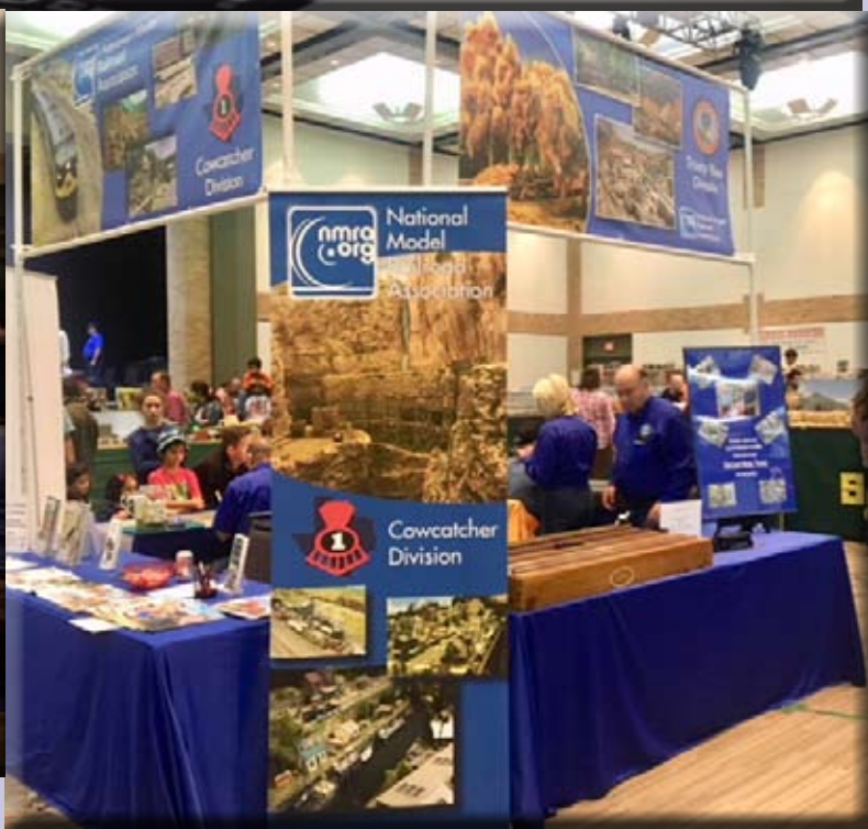
Cowcatcher Division One Photo Gallery