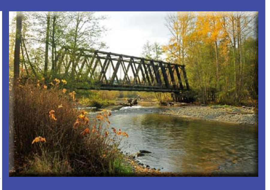
Raflroad Bridge Park