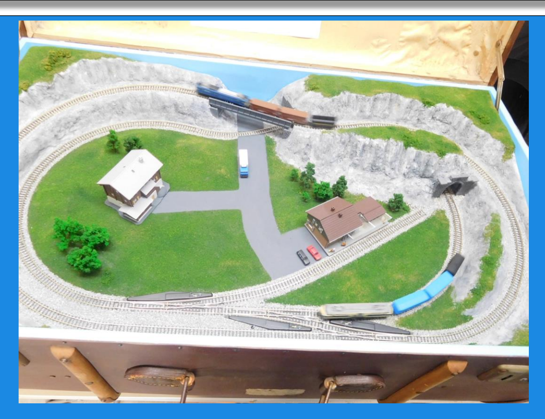
Check out this Z Scale operating layout built inside this 100 year old suitcase!