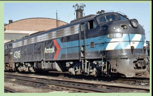
50 years ago –Amtrak train service begins

May's meeting returns to the Texas Western Model RR Club. The meeting will also be available via zoom.