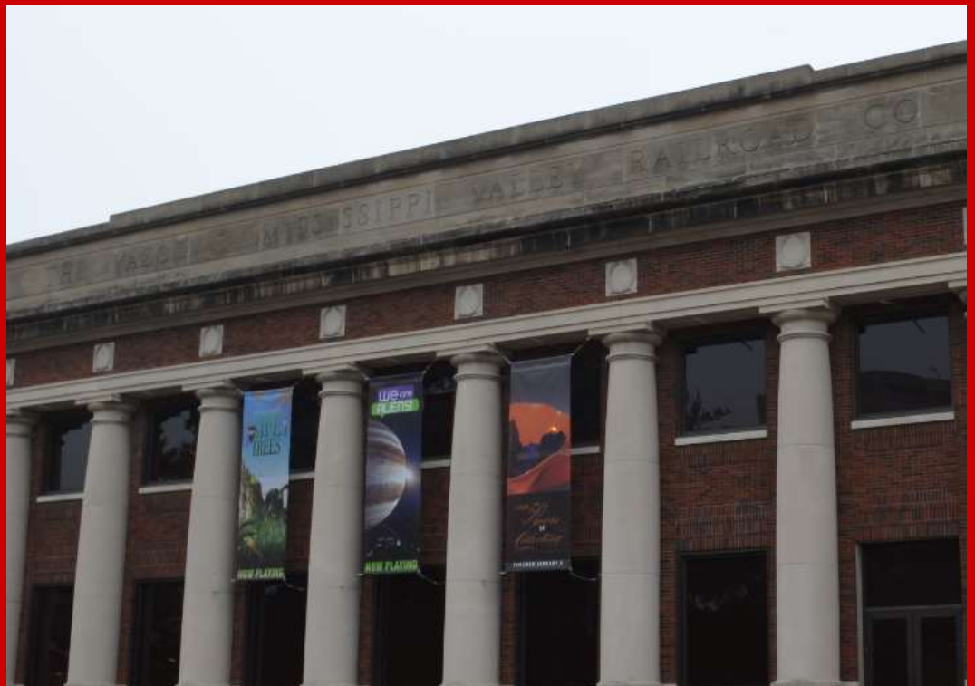
The Yazoo and Mississippi Valley Railway Company Depot in Baton Rouge, Louisiana