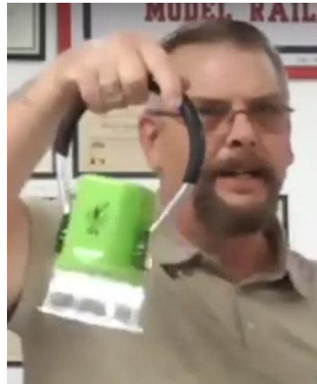
MODERN HANDHELD LAMP