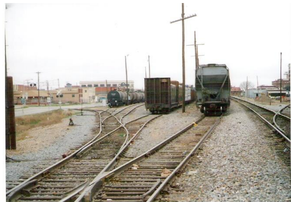
T&P 1 ST STREET YARD ABILENE TX MARCH 1998