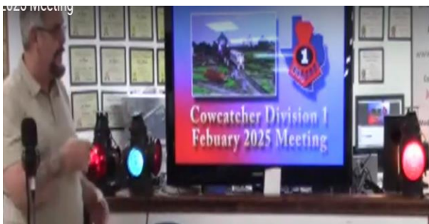
LIGHTED 100 YEAR OLD LANTERNS