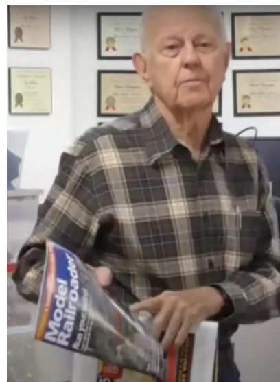
PRICE OF MODEL RAILROADER MAGAZINE THEN & NOW!