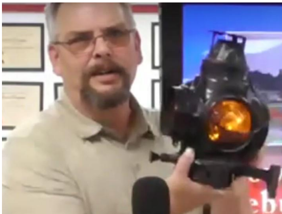
HEAVY 15-20 POUNDS