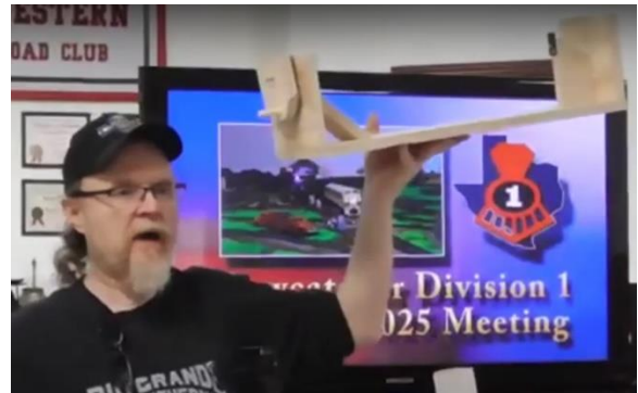
PINE TREE MAKER